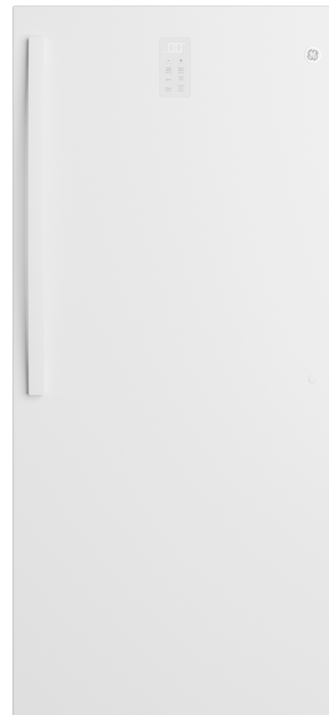
Model FUF18SZRWW- White