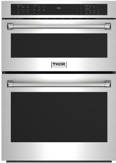
Product: 30 Inch Professional Combination Microwave and Wall Ovens in Stainless Steel