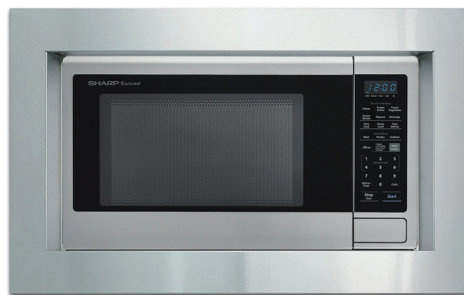
RK56S27F and RK56S30F