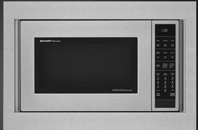
SMC1585BS Convection Microwave Oven with the RK94S30F Trim Kit

Includes Ducting, Finish Trim, and Easy-to-Follow Instructions