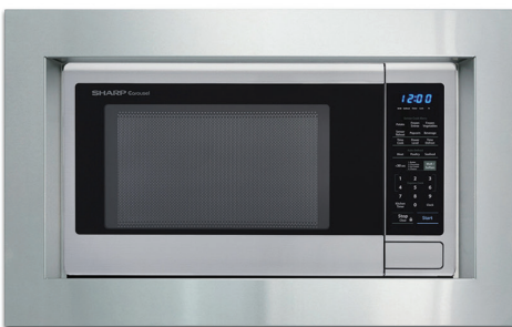
RK49S27F and RK49S30F