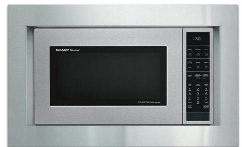
RK94S27F and RK94S30F