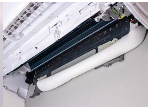
Complete access to the coils for easy cleaning