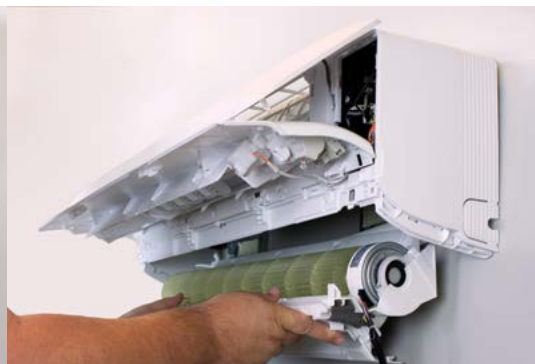
Remove screws then slide out the blower wheel assembly