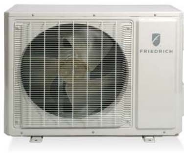
MRM18Y3J, MRM24Y3J, MRM36Y3J