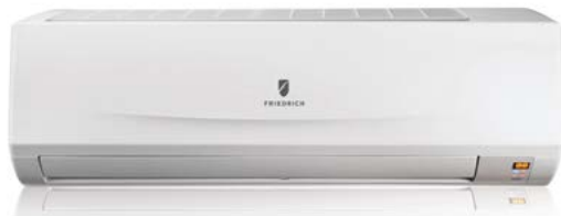
115 volt models MWM09Y1J, MWM12Y1J

Superb performance and excellent value, you get both at exceptional pricing.