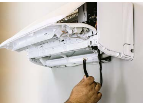
Unplug the wire harness