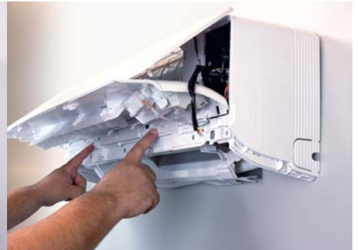
Lock the access panel