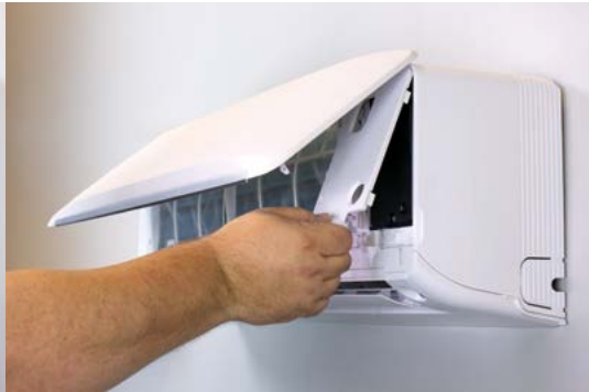
Remove electrical access panels (2)