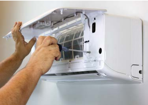
Back out electrical panel screws

YOU CAN ACCESS THE BLOWER WHEEL ASSEMBLY AND SLIDE IT OUT FOR FULL ACCESS TO THE INDOOR COIL