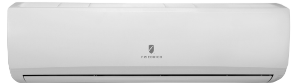
MW24Y3J, MW30Y3J, MW36Y3J