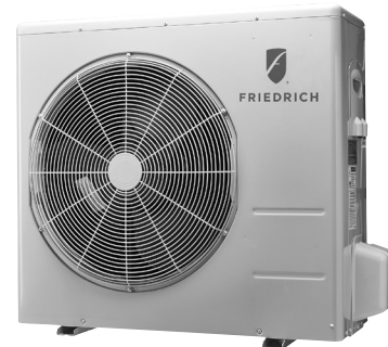
MR24Y3J, MR30Y3J, MR36Y3J