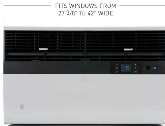
Kühl SS, SM and SL Models Kühl+ ES, YS, EM, YM, EL and YL Models