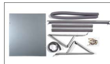
KWIKSB, KWIKMB, KWIKLB