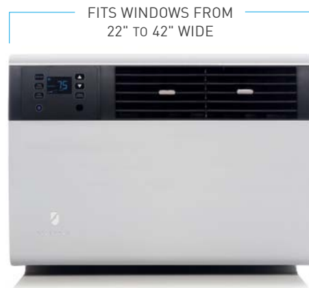
Kühl SQ/EQ Models

*Requires the FriedrichLink® Wi-Fi optional accessory.