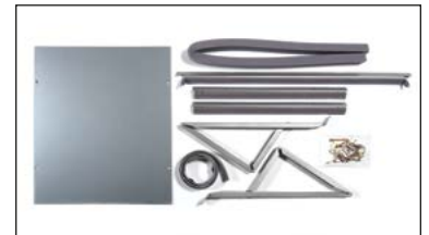
KWIKSB, KWIKMB, KWIKLB