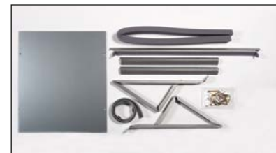
KWIKSB, KWIKMB, KWIKLB