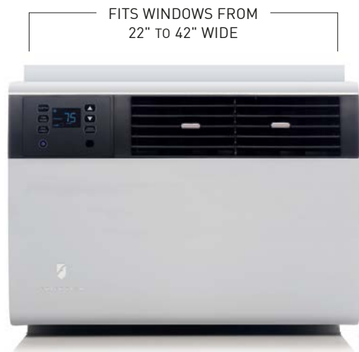
Kühl SQ/EQ Models

Full LCD display shows MODE, FAN SPEED, SET TEMPERATURE and SCHEDULE. Adjust TEMPERATURE and FAN SPEEDS, set AUTO MODE and turn the SCHEDULE ON/OFF.