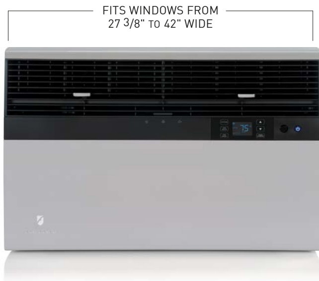
Kühl SS, SM and SL Models Kühl+ ES, YS, EM, YM, EL and YL Models