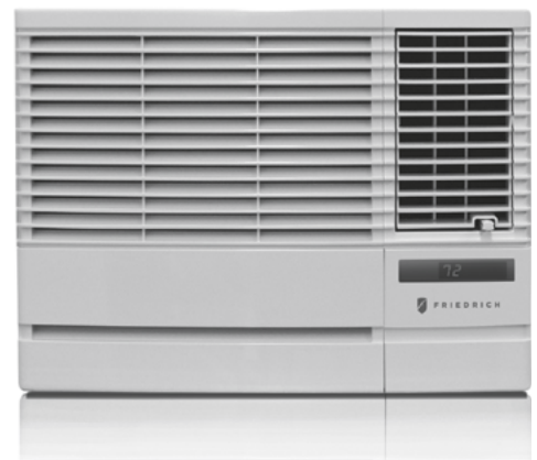
CP06, CP08, CP10, CP12, CP15, CP18, CP24 EP08, EP12, EP18, EP24