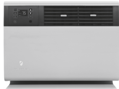
Kühl SQ/EQ Models