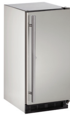
STAINLESS SOLID (LOCK)