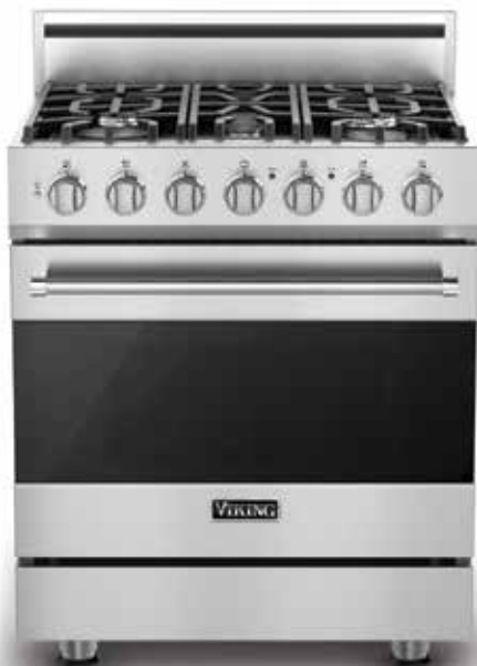
30" Wide Gas Self-Clean Range (Shown with optional 6" H. backguard)