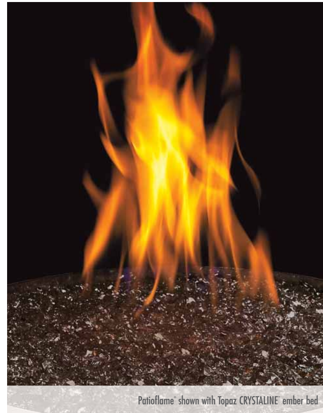
Patioflame® shown with Topaz CRYSTALINE™ ember bed

GPFG 60,000 BTU's 4 ¾" h x 20" diameter Natural gas or propane