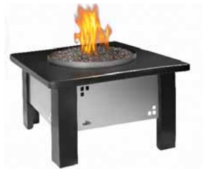
Table and Black Granite Top