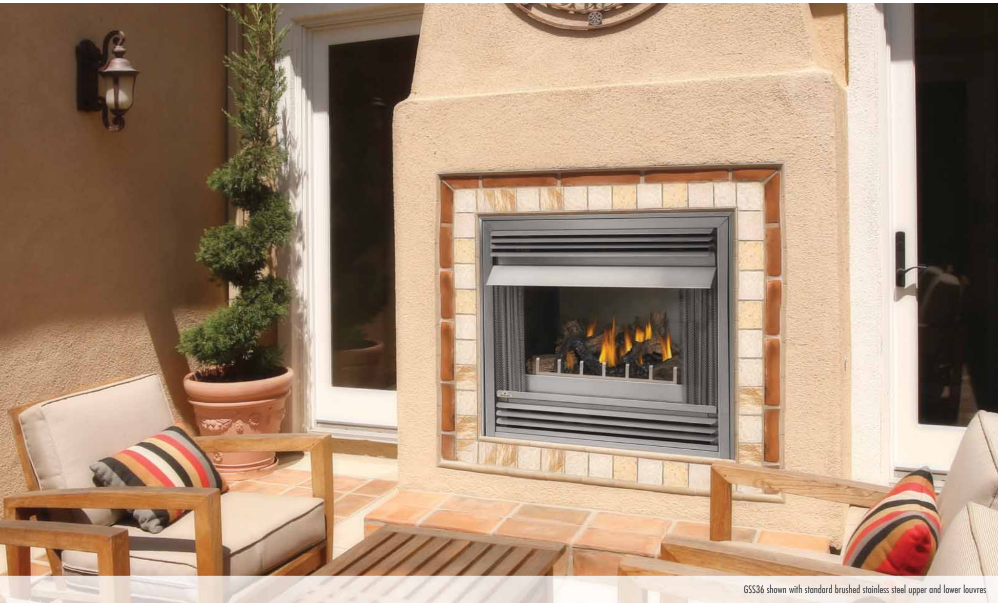
GSS36 shown with standard brushed stainless steel upper and lower louvers