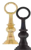
Andirons 24 Karat Gold Plated or Painted Black Finishes