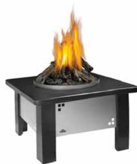
Table and Black Granite Top