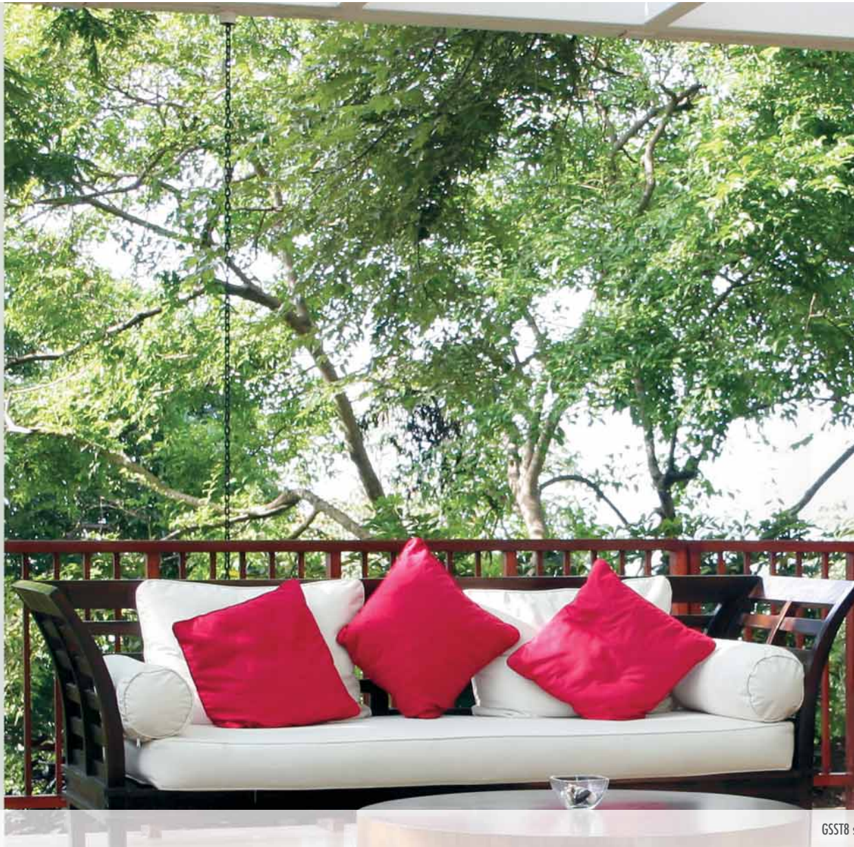
GSST8 shown with standard brushed stainless steel frame and cabinet