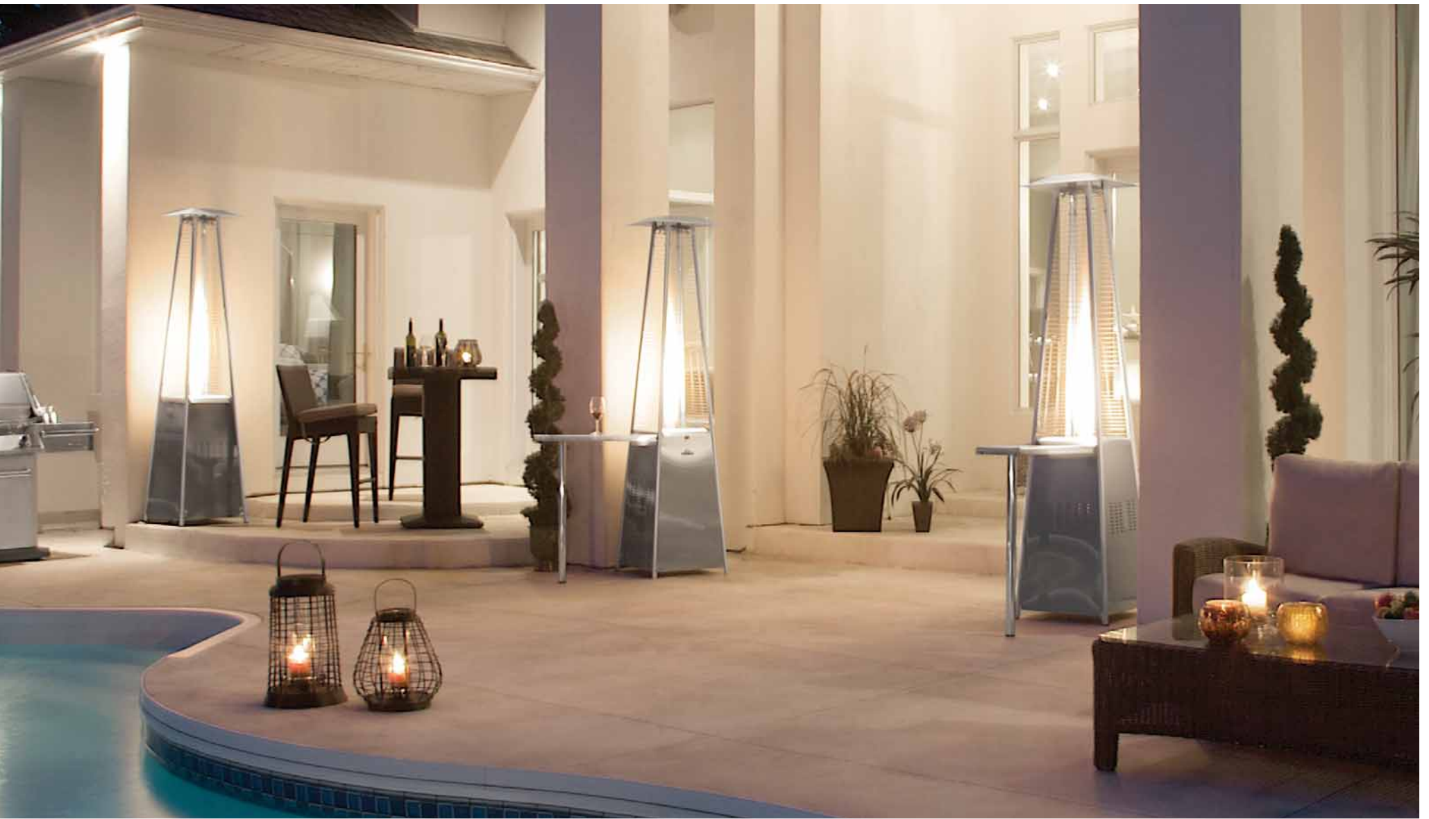
Bellagio® Patio Torch shown with optional side shelf and bar table