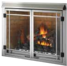
Decorative Door Brushed Stainless Steel (Standard with unit)