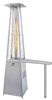
Side Shelf and Bar Table