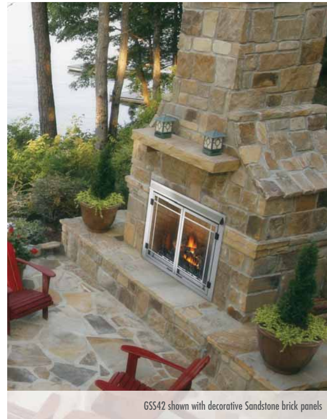
GSS42 shown with decorative Sandstone brick panels