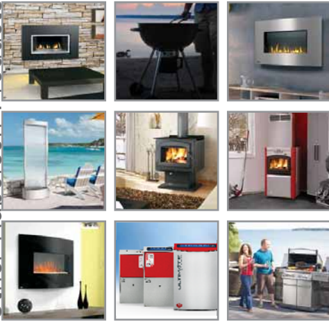
Fireplace Inserts • Charcoal Grills • Gas Fireplaces • Waterfalls • Wood Stoves Hybrid Furnaces • Electric Fireplaces • Heating & Cooling • Gourmet Grills