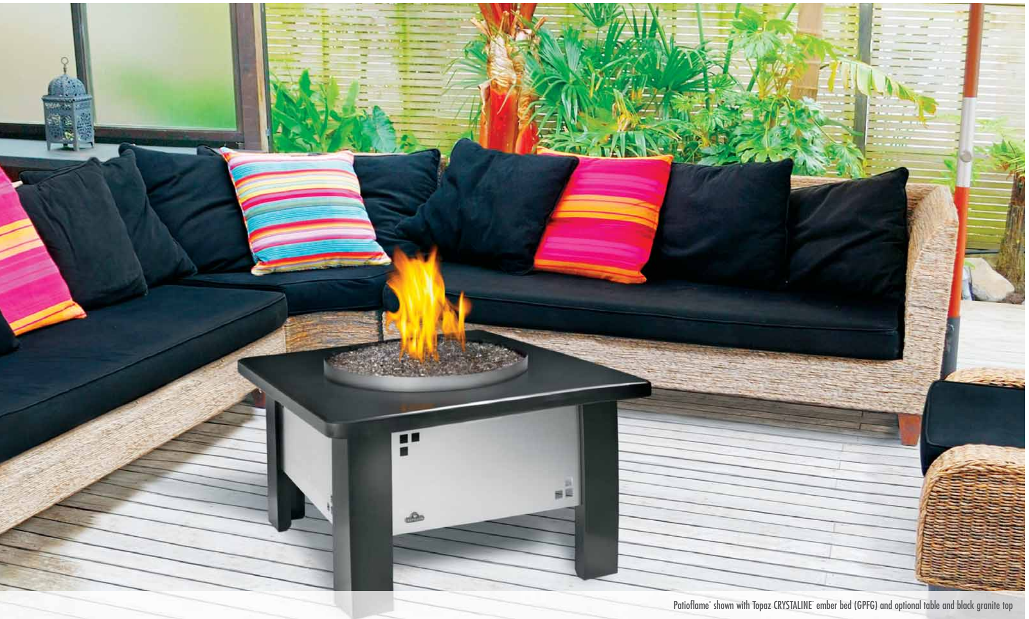
Patioflame® shown with Topaz CRYSTALINE® ember bed (GPFG) and optional table and black granite top