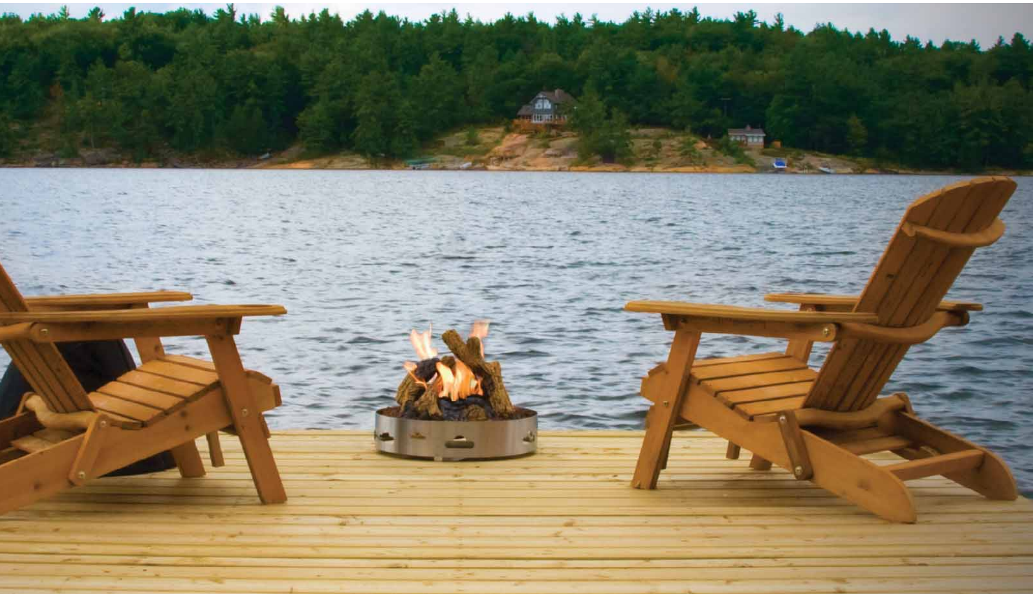
Patioflame ® shown with GLOCAST log set (GPF)