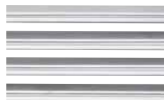
Upper/Lower Louvres Brushed Stainless Steel (Standard with unit)