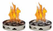
Optional River Rock Media Kits Multi-Coloured or Grey Finishes