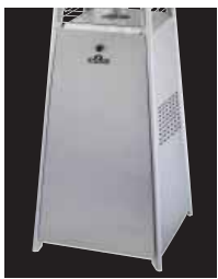
Propane Access Door