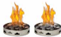
Optional River Rock Media Kits Multi-Coloured or Grey Finishes