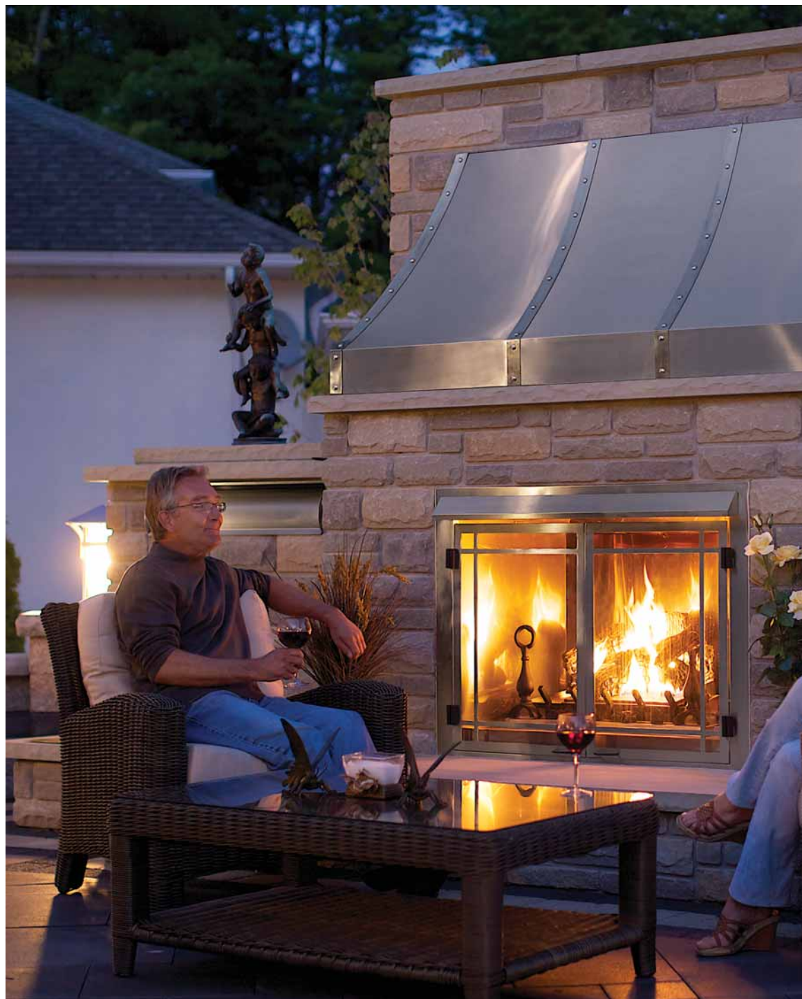
GSS42 shown with standard stainless steel decorative door and cast iron andirons