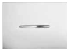
Fireplace Cover Brushed Stainless Steel (Standard with unit)