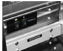
Convenient On/Off and Accent Light Switches (Standard with unit)