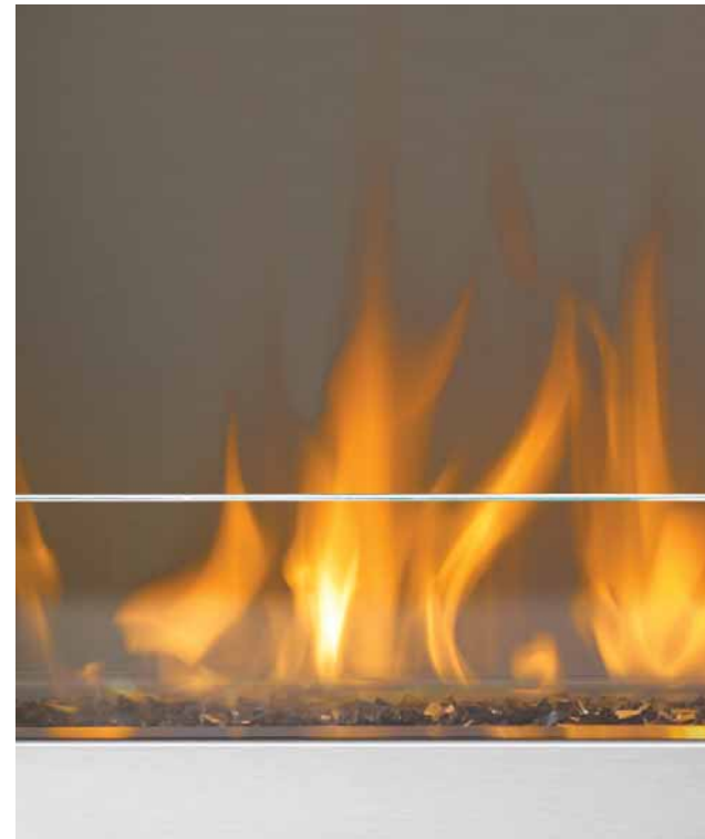
GSS48 close up - standard glass wind deflector