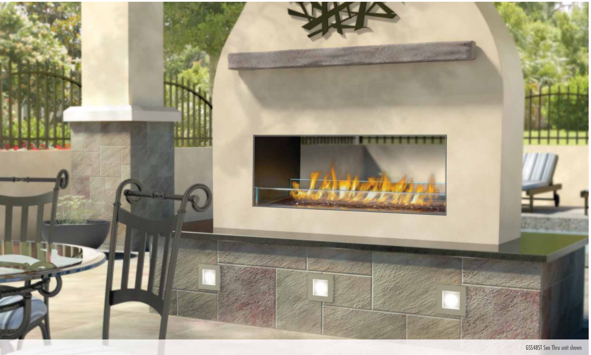
GSS48ST See Thru unit shown