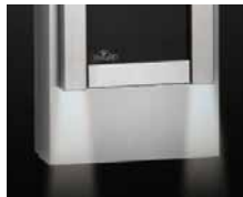
Upper/Lower Accent Lights