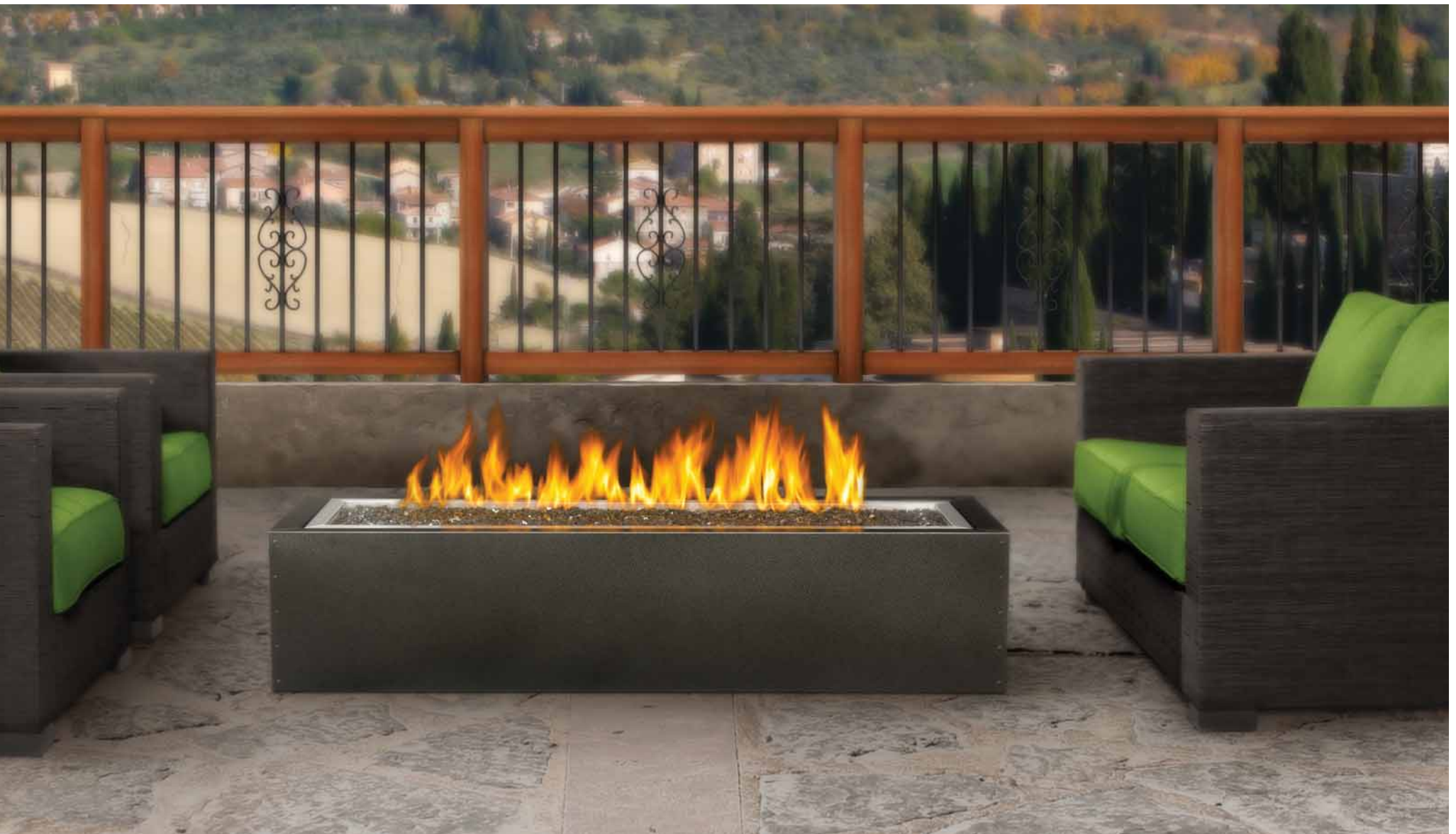
GPFL48MHP shown with standard Topaz CRYSTALINE® ember bed