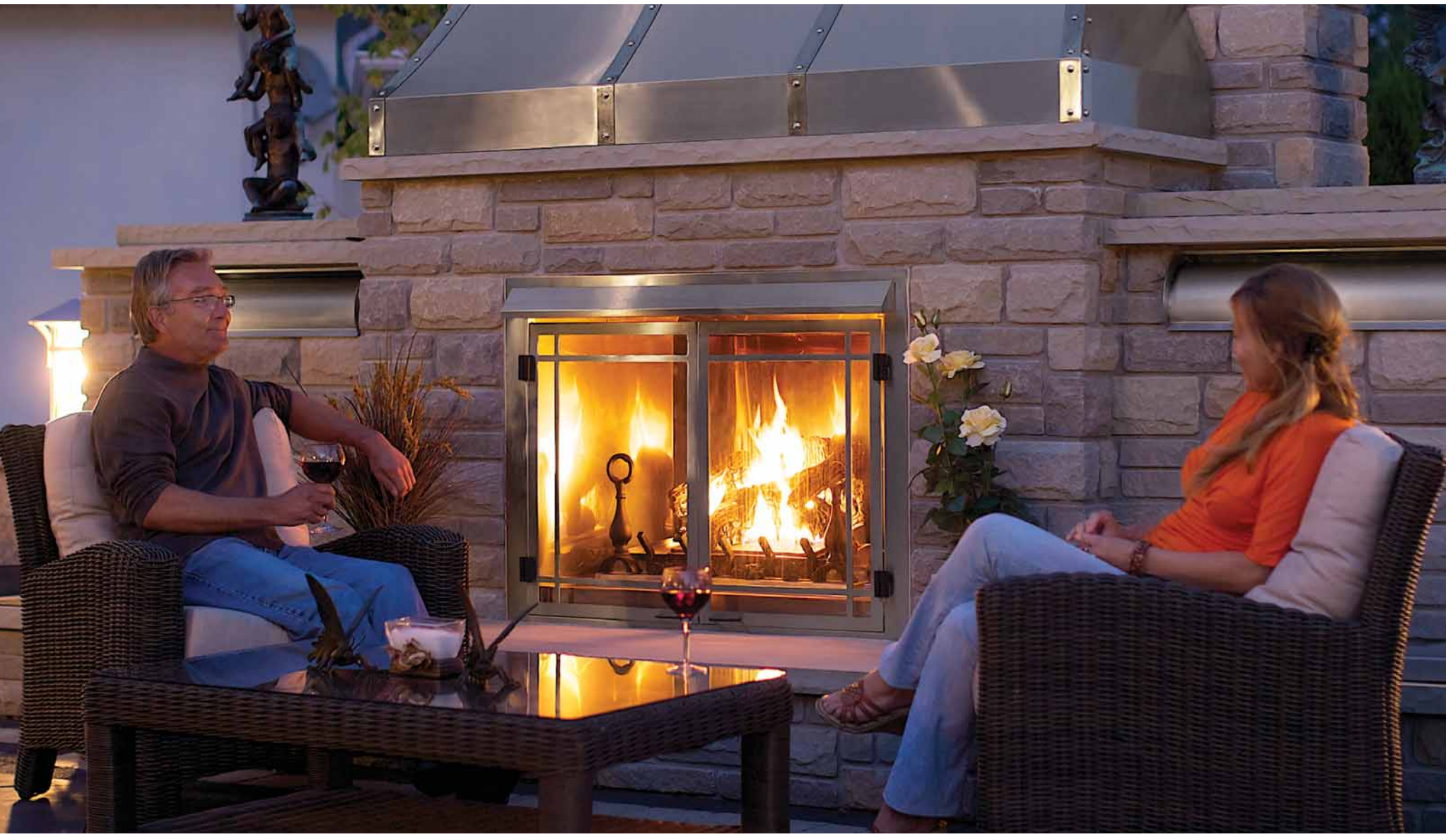
GSS42 shown with standard stainless steel decorative door and cast iron andirons