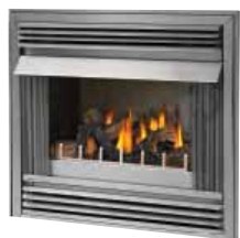
Safety Screen Brushed Stainless Steel (Standard with unit)