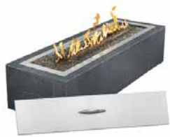
Brushed Stainless Steel Cover* and Hammertone Pewter Cabinet (Standard with unit)

*Cover not for use with the optional river rock media kits