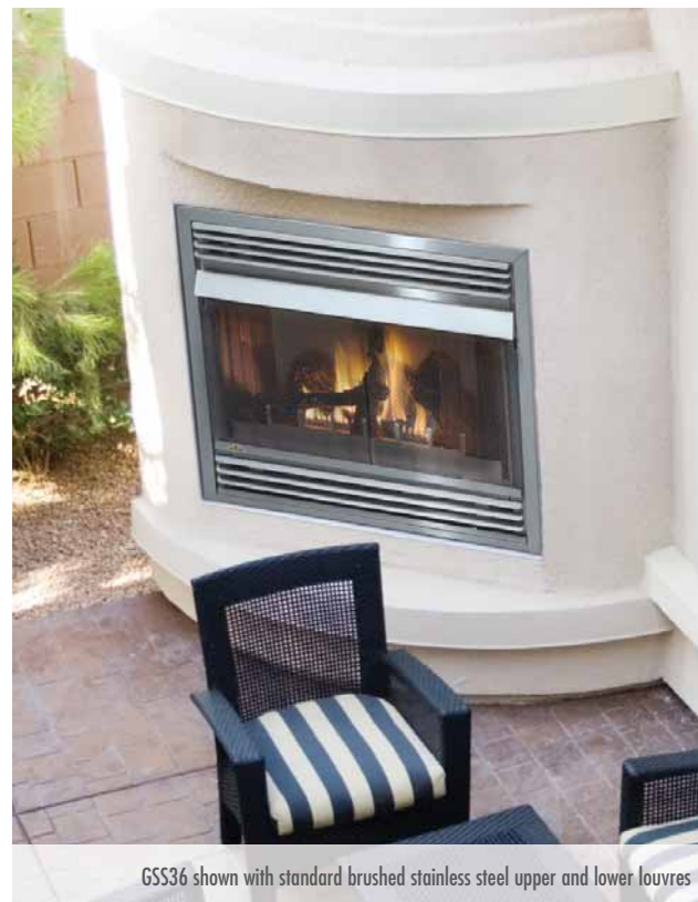
GSS36 shown with standard brushed stainless steel upper and lower louvers