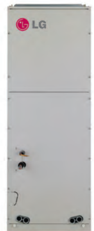
Vertical- Horizontal Air Handling Unit