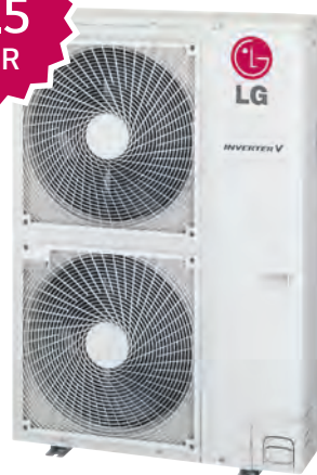
Eight-Zone Multi F MAX Outdoor Units