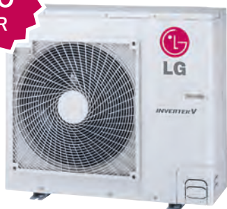
Quad-Zone Multi F Outdoor Units