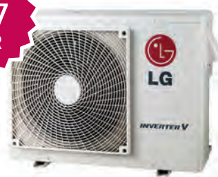
Tri-Zone Multi F Outdoor Units