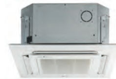
Ceiling Cassette Indoor Units