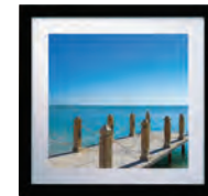
Art Cool™ Gallery Inverter Indoor Units