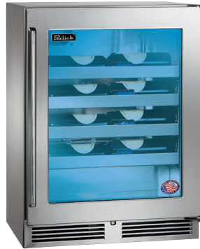
Glass Door Model