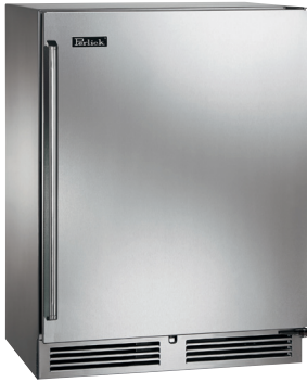
Solid Door Model

Perlick ® QUALITY & INNOVATION THAT INSPIRES