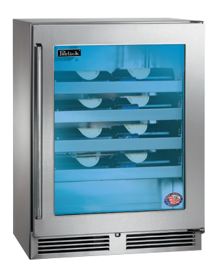
Solid Door Model