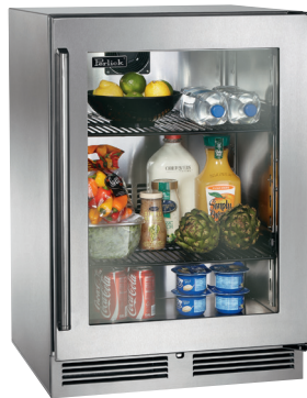
Glass Door Model