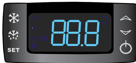
Figure 1. Digital Temperature Controller

Perlick Signature Series, C-Series, Shallow-Depth Series and ADA Compliant freezer units come standard with state-of-the-art digital control. Please note there are two sets of instructions; one for 24" Signature Series Dual-Zone models, and another set for 15", 24" Single-Zone, and 48" Signature Series, C-Series, Shallow-Depth and ADA-Compliant Freezer models.