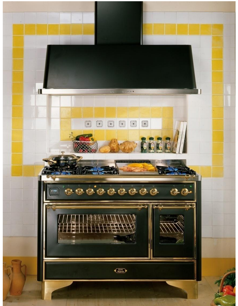
Upper Handrail included