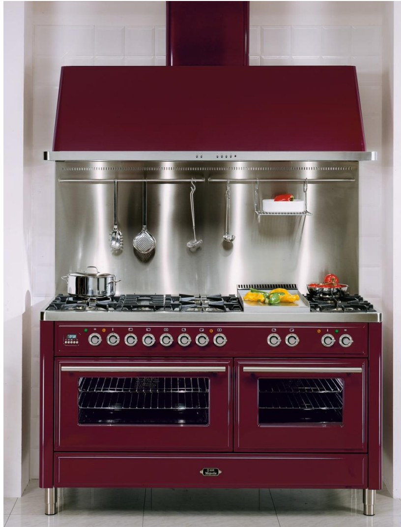
Easy Glide Rolling Racks included