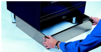
Optional Wrap Around Toe Kick