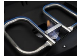
Dual stainless steel burners for direct or indirect grilling