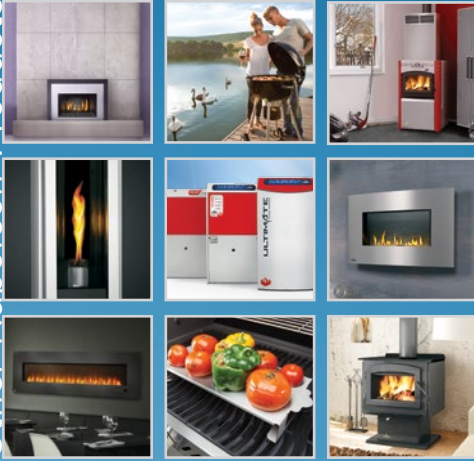
Fireplace Inserts • Charcoal Grills • Hybrid Furnaces • Outdoor Fireplaces Gas Furnaces • Gas Fireplaces • Electric Fireplaces • Accessories • Wood Stoves