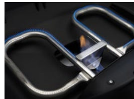
Dual stainless steel burners for direct or indirect grilling