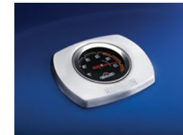
ACCU-PROBE™ Temperature Gauge safely and instantly reads the internal temperature.