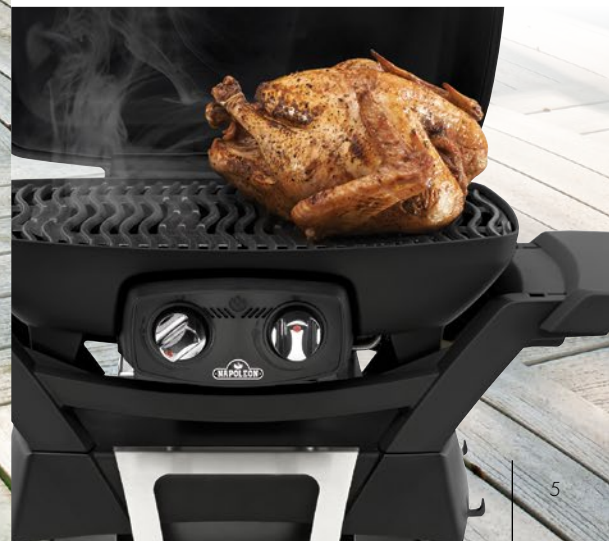
PRO285 and 285 Stand