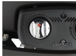
Ergonomic Control Knobs