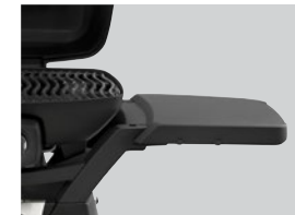
Spacious Side Shelves with Integrated Towel and Utensil Holders (PRO285-STAND)