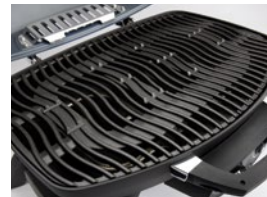
Porcelainized Cast Iron WAVE™ Cooking Grids