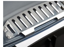
Superior wind proof design holds the heat in