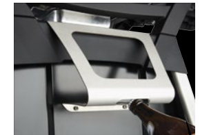
Stainless steel condiment tray with integrated bottle opener (PRO285-STAND)