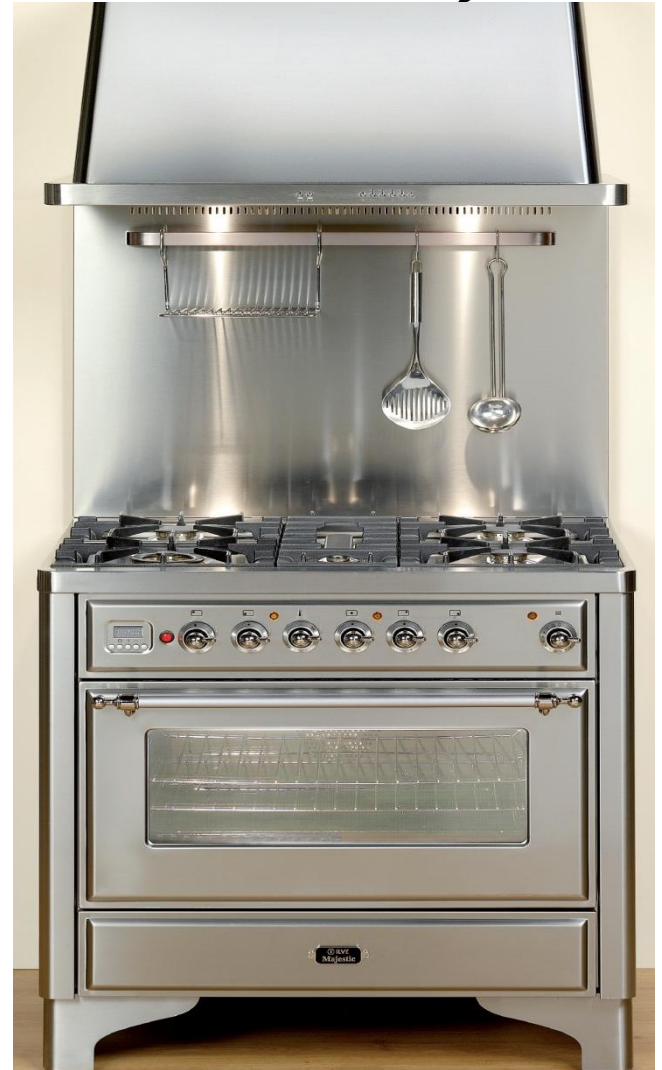
* Optional Cooktop Surfaces