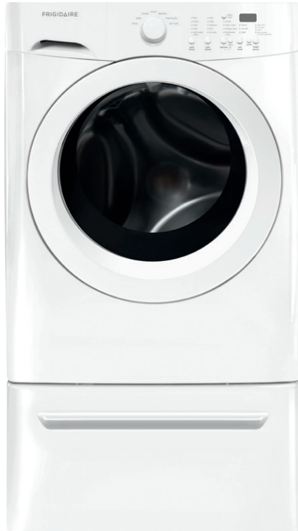
Optional SpaceWise® Pedestal Drawer Shown