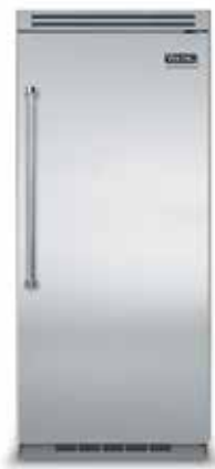
36"W. All Refrigerator