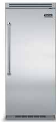
36"W. All Freezer