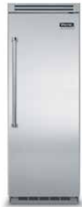
30"W. All Freezer