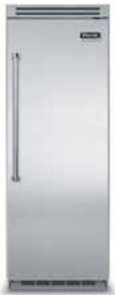
30"W. All Refrigerator

Viking Professional built-in refrigeration offers cold storage options in a range of configurations that fit perfectly to your functional and styling desires. These professional quality refrigerator/freezers provide the ultimate in cold storage, with dedicated drawers and shelves to accommodate every item on your grocery list. Have your Viking Professional refrigerator blend seamlessly into cabinetry with custom panel options, or further adorn your refrigerator by choosing from one of our 12 exclusive finishes.