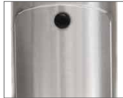
Easy Access Door