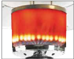
Durable, High Efficiency Burner

This natural gas model of the Cast Aluminum series is sleek and slender with a sturdy base, taking up minimal space in your outdoor living area. Elaborate details make an impressive feature in your outdoor décor and with a cast aluminum body, quality is not sacrificed. A 20' diameter of radiant heat provides an efficient heating source for your outdoor living area.