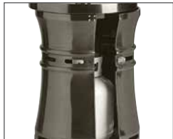
Propane Access Door

Sleek and smooth, the Gun Metal patio heater is simple but impressive in design and suits any outdoor living environment. A 20' diameter of radiant heat provides a comfortable and efficient heating source for your outdoor living area so you and your guests can enjoy yourselves comfortably. Available in propane only, this model features a charming propane compartment with swing open door for tank access and doubles as a convenient and sturdy table top. Gather and enjoy.