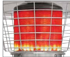
Durable, High Efficiency Burner