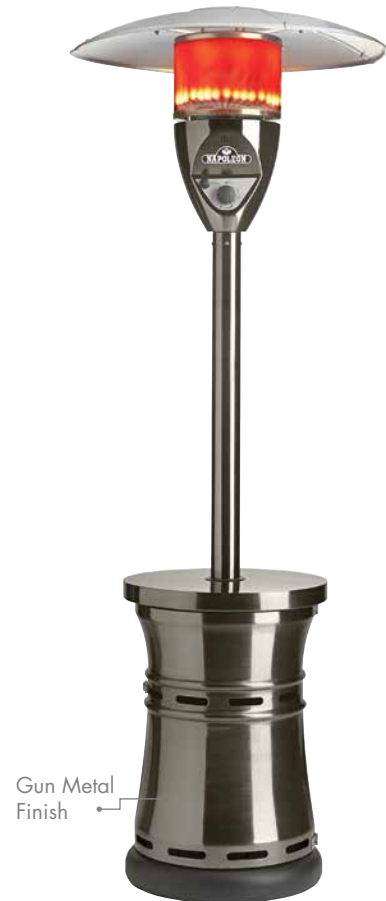
Gun Metal Finish