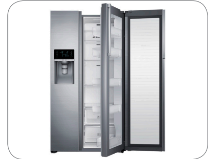
Food ShowCase Fridge Door