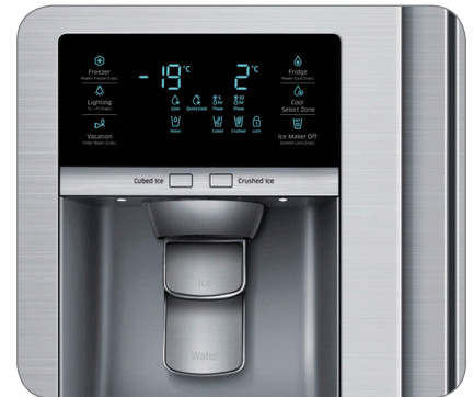
External Filtered Water and Ice Dispenser