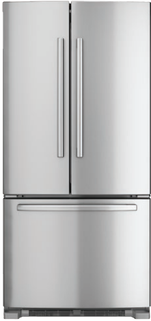
B22FT80SNS Stainless Steel

The standard-depth French Door refrigerator offers large storage capacity and keeps your produce fresh longer.