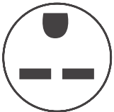
Plug Type (NEMA) 6-15P

1 Warranty 5 year sealed system/1 year full parts and labor.