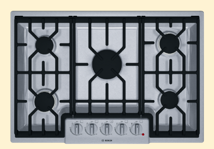
NGM8054UC Stainless Steel