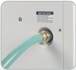
Continuous drain option from rear drain outlet.