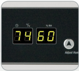
Displays room temperature and humidity %