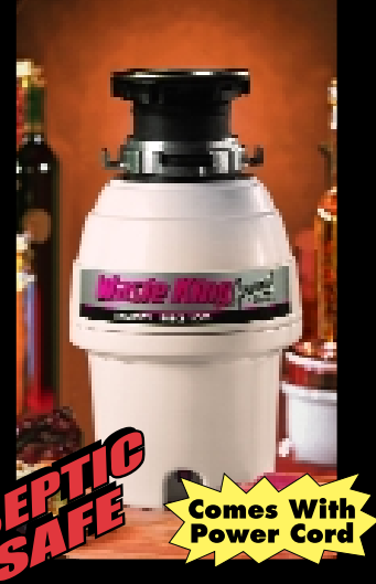
MODEL 3100 1/2HP

8 Year In-Home Warranty Lifetime Corrosion Warranty