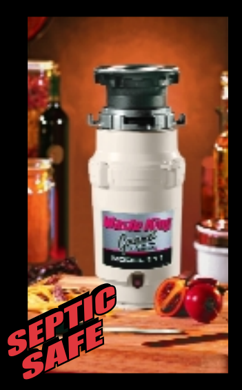
MODEL 111 1/3HP