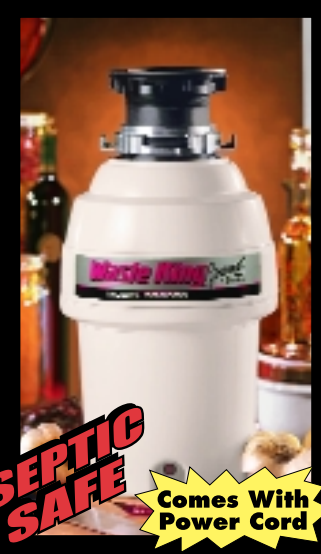
MODEL 8000 1HP