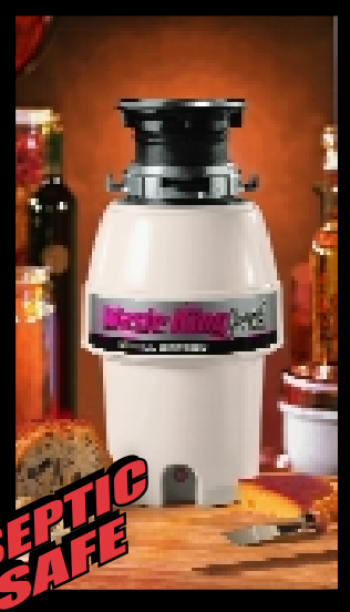
MODEL 2600 1/2HP

5 Year In-Home Warranty Lifetime Corrosion Warranty