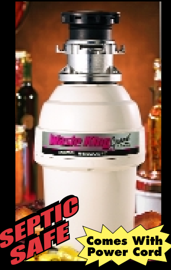
MODEL 8000TC 1HP