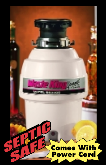
MODEL 3300 3/4HP

10 Year In-Home Warranty Lifetime Corrosion Warranty