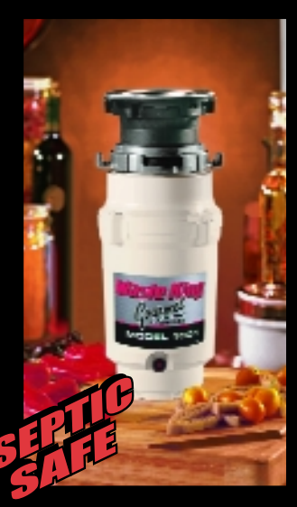
MODEL 1001 1/2HP