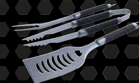
55040 Tool Set