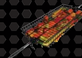
64005 Rotisserie Basket