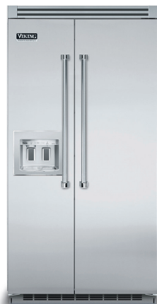
42"W. Side-by-Side with Dispenser