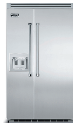
48"W. Side-by-Side with Dispenser