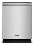
Dishwasher 24"W. (Custom panel and water softener models available)