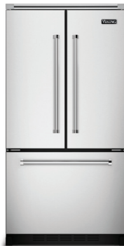
French-Door Bottom-Freezer 36"W.