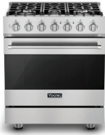
Dual Fuel Self-Clean Range 30"W.