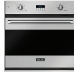
Electric Single Oven 30"W.