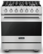
Gas Self-Clean Range 30"W.