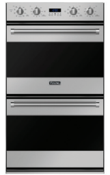
Electric Double Oven 30"W.