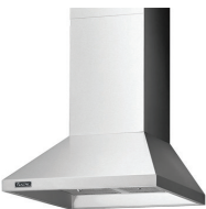
Chimney Wall Hood 30" and 36" widths available