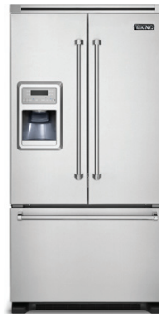
French-Door Bottom-Freezer with Ice and Water Dispenser 36"W.