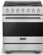
Electric Self-Clean Range 30"W.