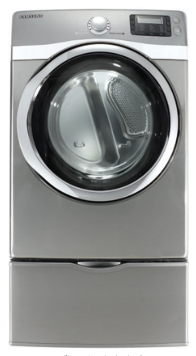
(Shown with optional pedestal)

Ranked "Highest in Customer Satisfaction with Clothes Dryers" by J.D. Power and Associates.*