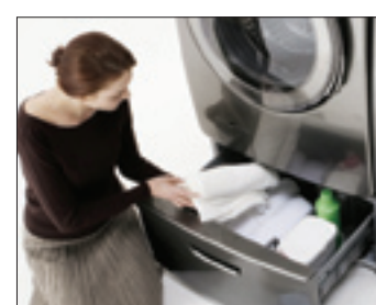
Optional Convenient 15" Pedestal