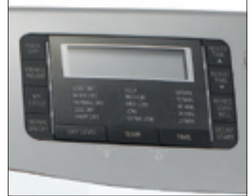
Large LCD Display