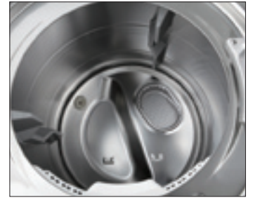
Large 7.5 cu. ft. Capacity and Stainless Steel Drum