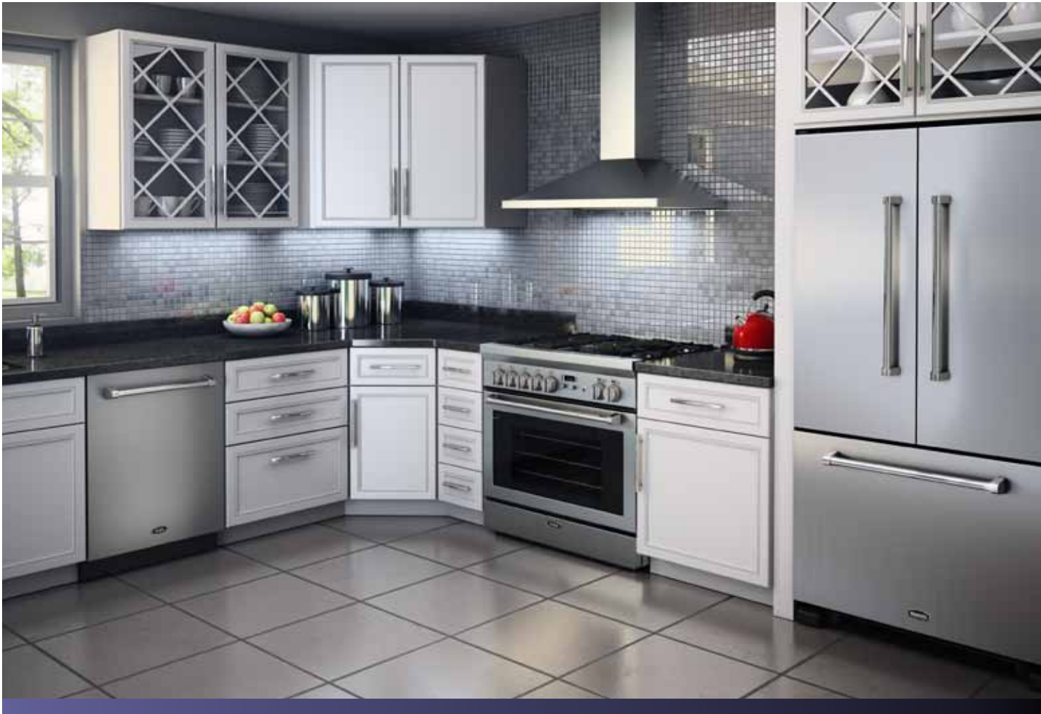
The New AGA MARVEL Professional Kitchen Suite