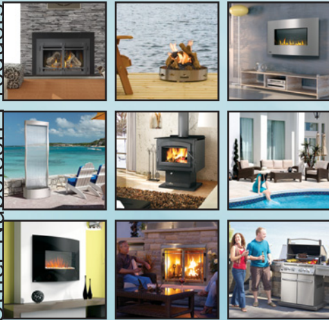
Fireplace Inserts • Patioflames • Gas Fireplaces • Waterfalls • Wood Stoves Casual Furniture • Electric Fireplaces • Outdoor Fireplaces • Gourmet Gas Grills