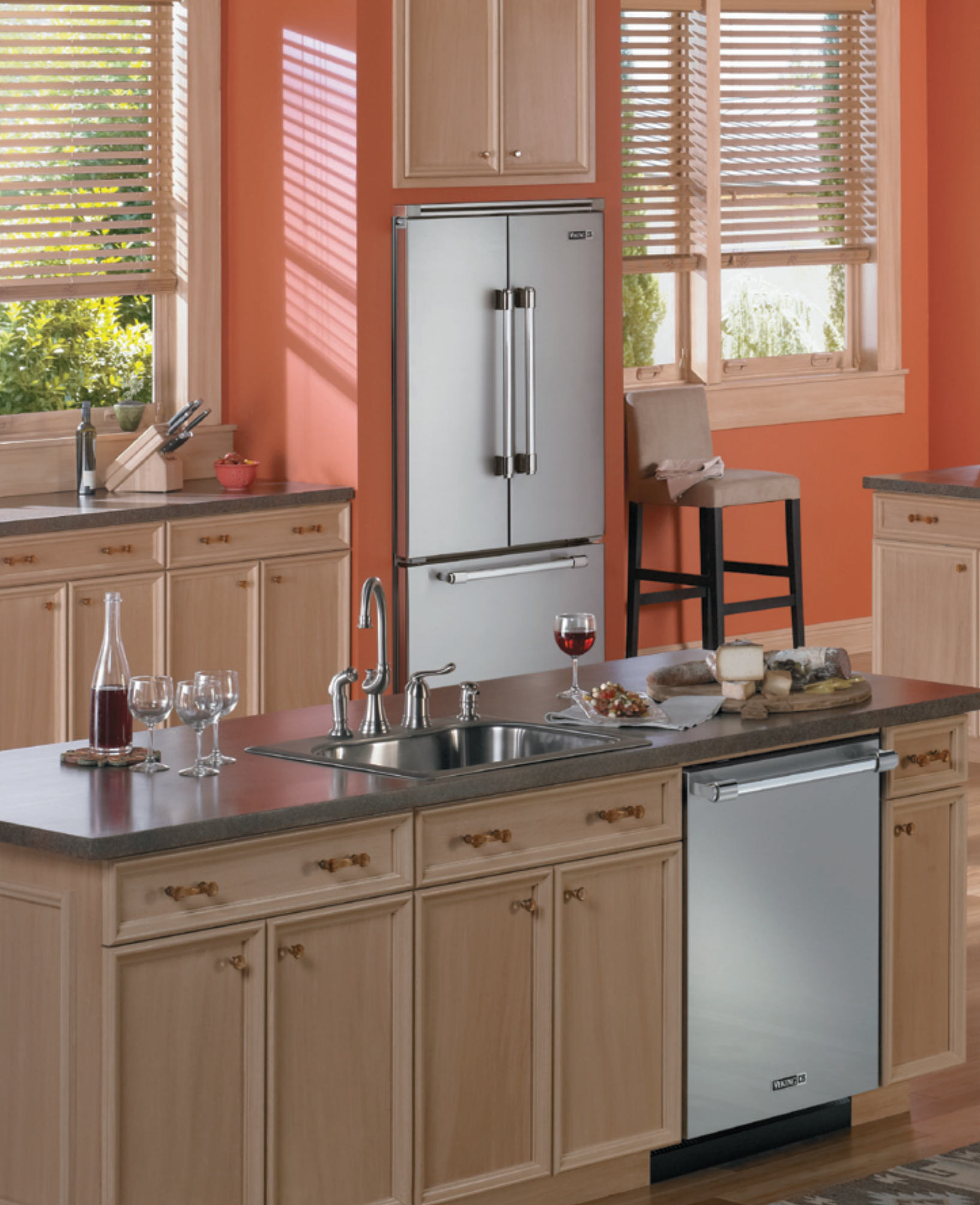
Viking D3's standard sizing and customizable options ensure it fits into your kitchen – and fits in with your design scheme.