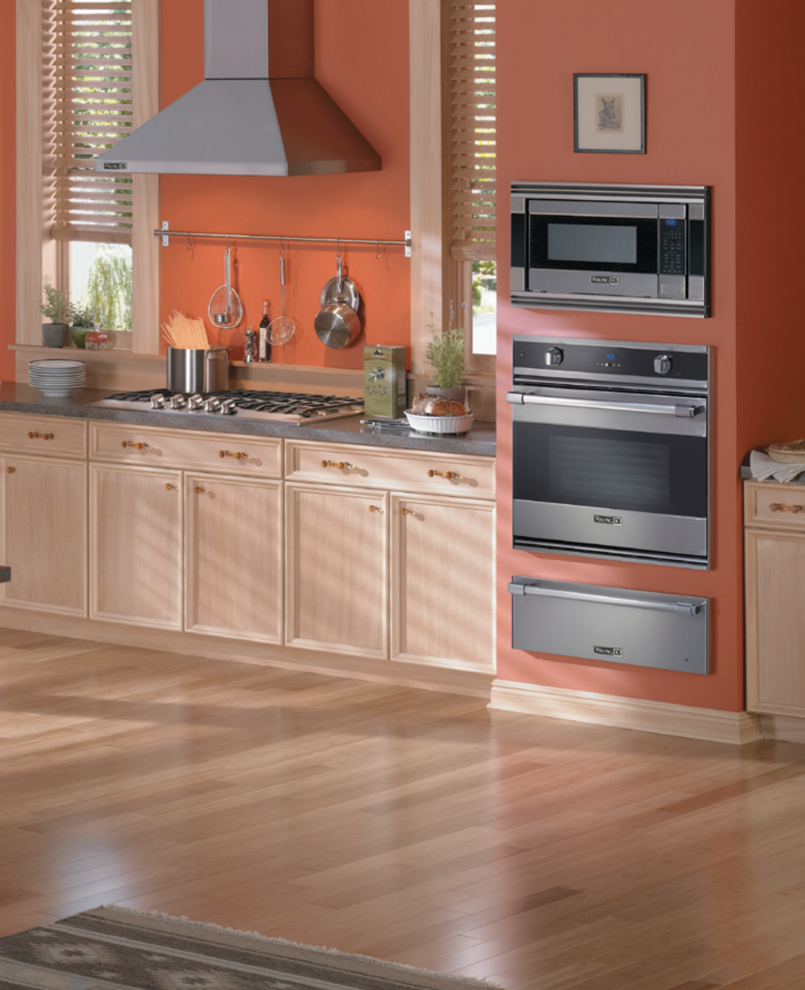
Whether you're outfitting a complete kitchen or upgrading a single product, the D3 Series complements your style.