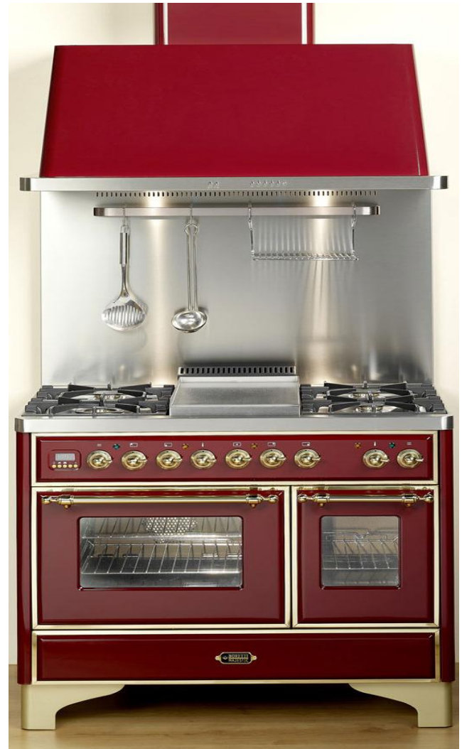
* Optional Cooktop Surfaces