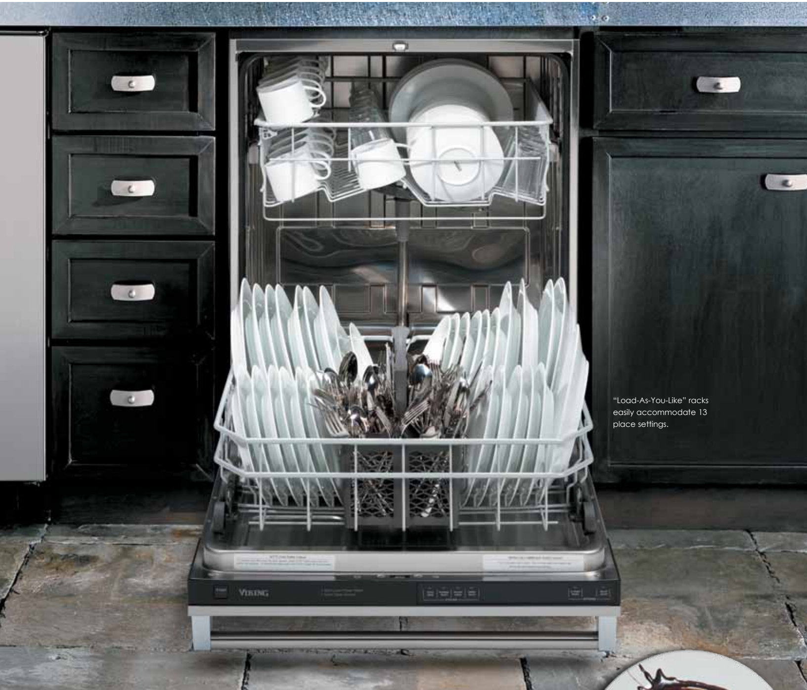
"Load-As-You-Like" racks easily accommodate 13 place settings.