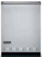
DFB450E Custom Panel Model with PDDPL24 Professional Door Panel