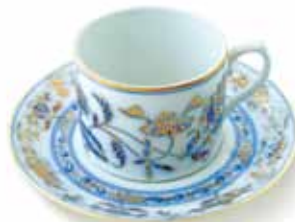
The versatile capacity cradles up to 15 place settings of china.