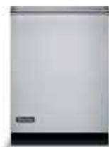
VDB200 Built-In Dishwasher