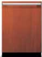
DFB450E Model with Custom Panel