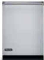
VDB325 Intelli-Wash Dishwasher