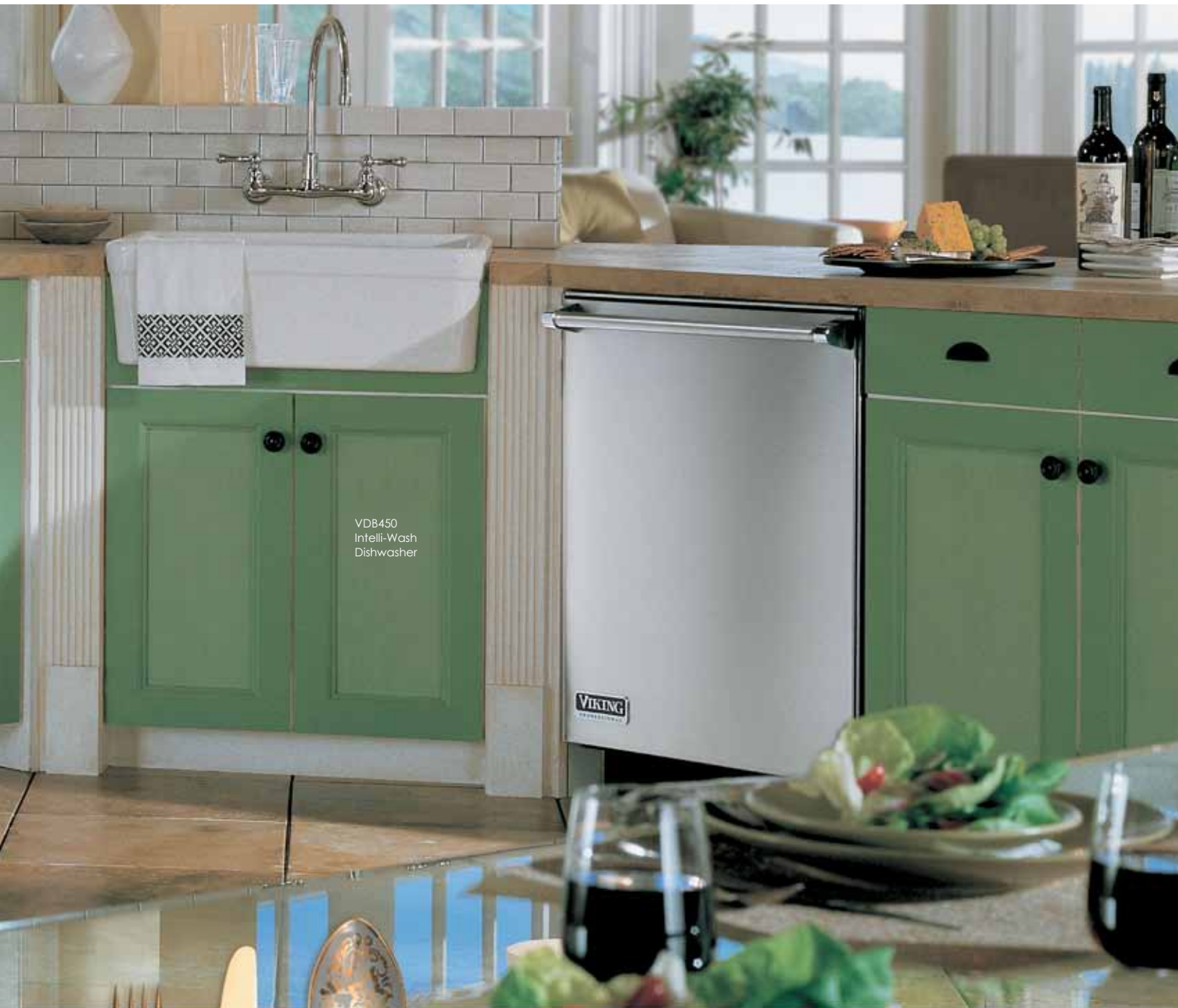
VDB450 Intelli-Wash Dishwasher