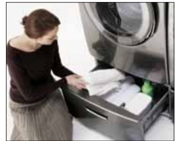
Optional Convenient 15" Pedestal

Actual color may vary. Design, specifications, and color availability are subject to change without notice. Non-metric weights and measurements are approximate.