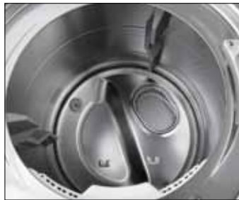
Large 7.3 cu. ft. Capacity and Stainless Steel Drum