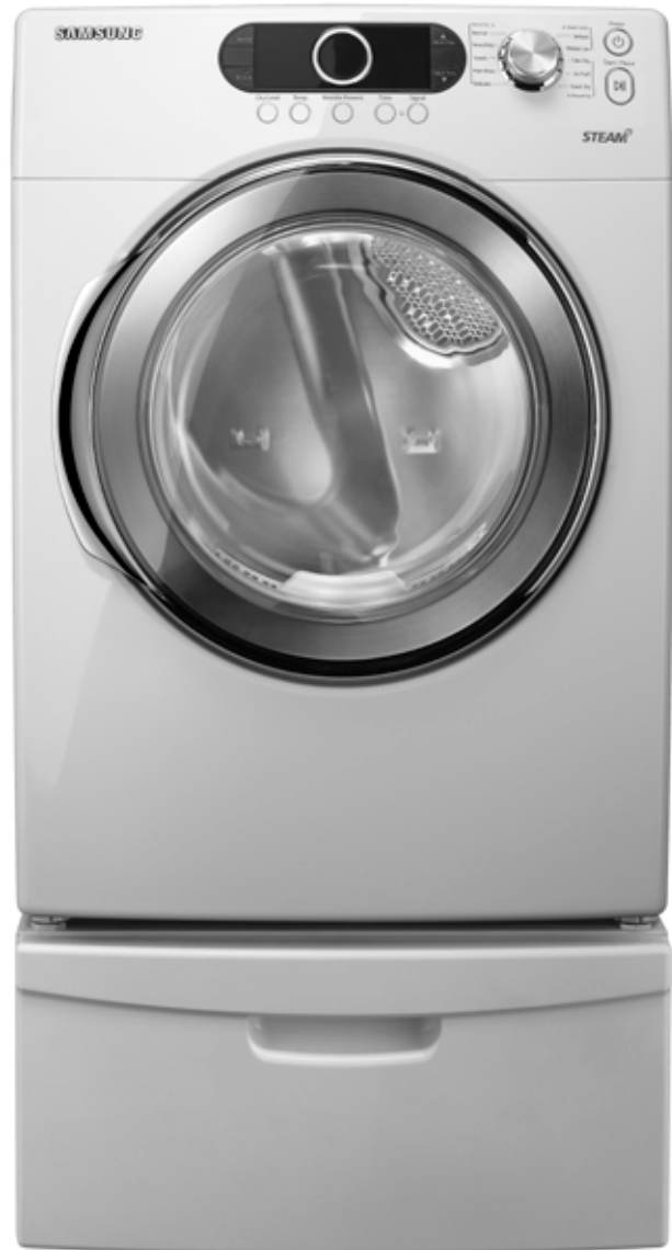
(Shown with optional pedestal)

Samsung Steam dryers offer Steam Refresh and Steam WrinkleCare cycles which use steam technology to reduce wrinkles and refresh clothing.