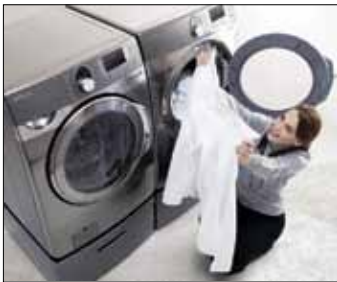
Steam Drying Technology