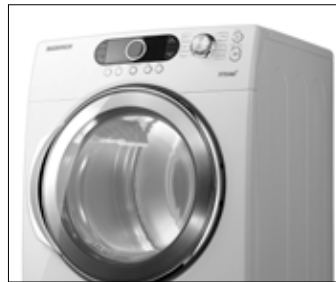
Graphic LED Digital Controls