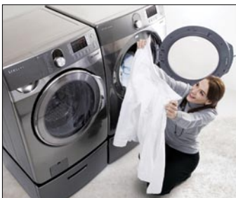
Sensor Drying Technology