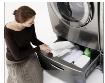
Optional Convenient 15" Pedestal

Design and specifications are subject to change without notice. Non-metric weights and measurements are approximate.