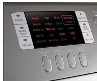
2.5" Large LCD Display with Electronic Controls