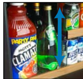
Fig. A: Half-width shelf allows vertical storage of tall items.