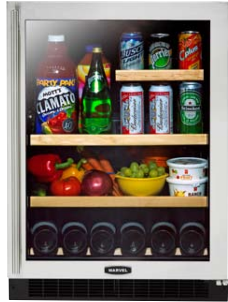
Model Shown: 6GARM-BS-G

6GARM-BB-O: Black cabinet, overlay solid door