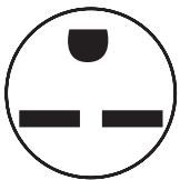
Plug Type (NEMA) 6-30P

1 Warranty 5 year sealed system/1 year full parts and labor.