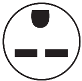
*Plug Type (NEMA) (B) 6-15P

NOTE: For planning purposes only. Always consult local and national electric codes. Refer to Product Installation Guide for detailed installation instructions on the web at frigidaire.com .