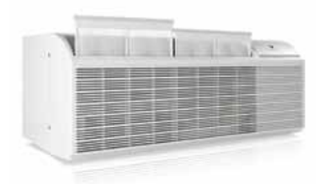
EASY-TO-CLEAN ANTIMICROBIAL AIR FILTERS ARE TOP-MOUNTED FOR QUICK ACCESS AND PROTECT AGAINST FUNGAL AND BACTERIAL GROWTH.