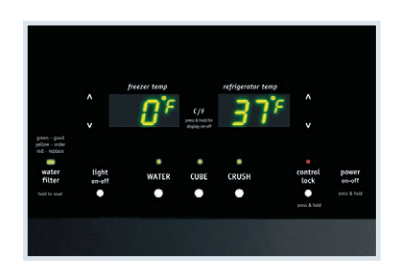
Express-Select™ Controls Easily select options with the touch of a button.

Organization System Our SpaceWise™ organization system makes it easy to keep food organized and easy to find when you need it.