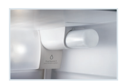
PureSource 3® Ice & Water Filtration Offers cleaner, better-tasting water and ice at your fingertips.

Designed to keep spills contained, making cleanup a breeze.