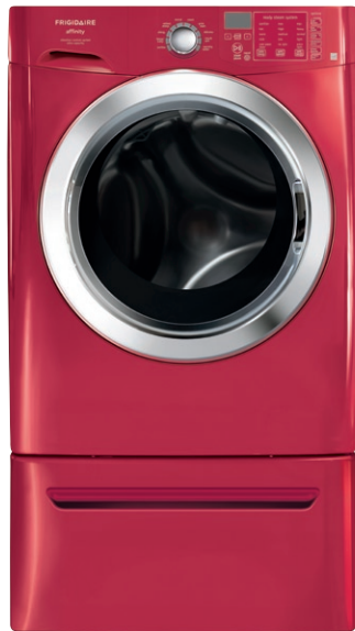
Optional SpaceWise™ Pedestal Drawer Shown