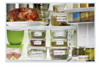
SpaceWise™ Organization System

Our SpaceWise™ organization system makes it easy to keep food organized and easy to find when you need it.