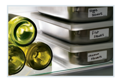
Most Usable Shelf Space<sup>1</sup> Our adjustable shelves have room to