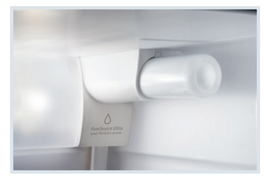
Best-in-Class Ice & Water Filtration<sup>2</sup>

Our SpaceWise™ organization system makes it easy to keep food organized and easy to find when you need it.