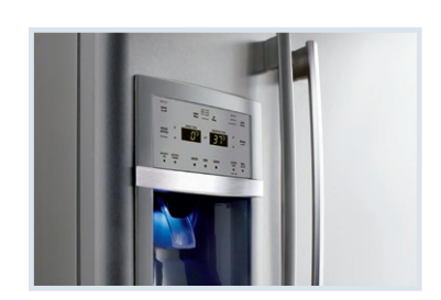
Real Stainless Steel Real stainless steel with a protective coating that reduces fingerprints and smudges so it's easy to clean.